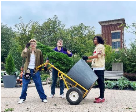
Student volunteers preparing the Terrace Garden for seasonal plantings