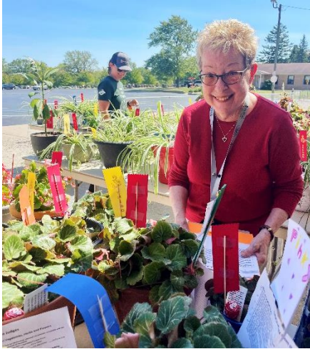
Volunteer judging plant entries as part of the School Children's Flower & Vegetable Show