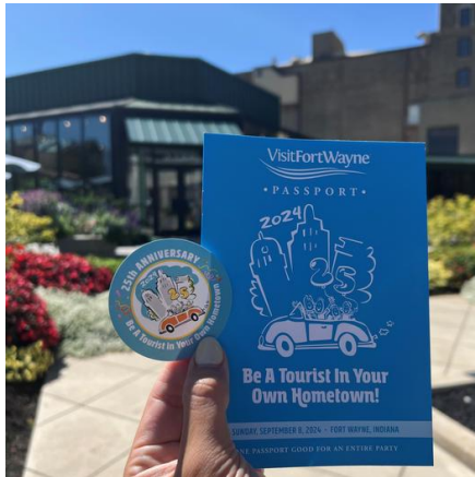
The 2024 Passport and sticker offered during Be A Tourist at the Botanical Conservatory