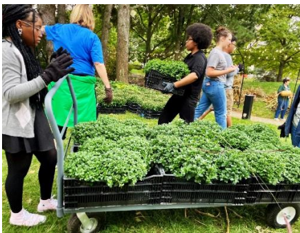
Student volunteers unloading plants for the Pumpkin Path Display