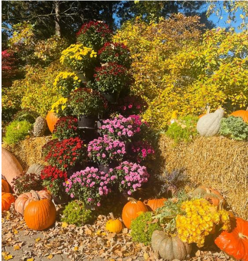
One of the featured mum trees as part of the 2024 Pumpkin Path