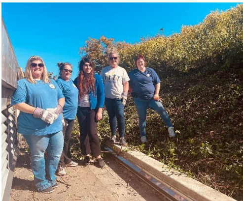
Employees with Department of Revenue volunteering on DOR Gives Back Day