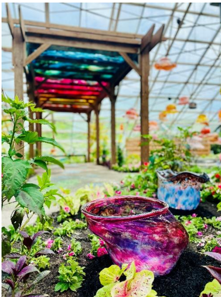
Stunning view of glass bowls with a featured pergola in the Raise a Glass!