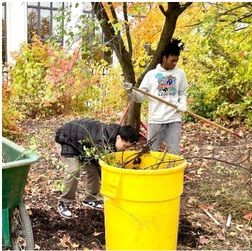
CAS Students removing invasive species for the addition of new