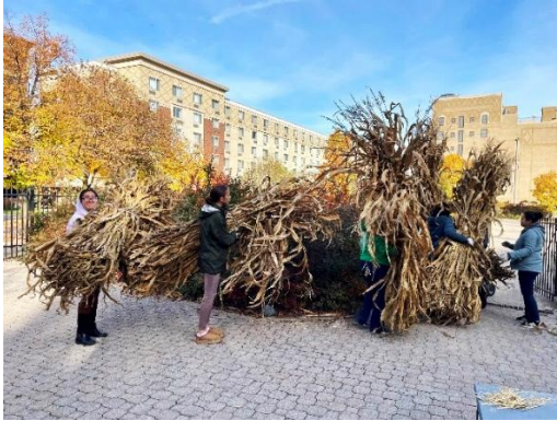
Students from South Side High School assisting with deconstruction of the