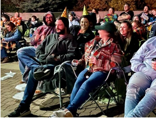
Audience enjoying participatory viewing during the Rocky Horror Picture Show