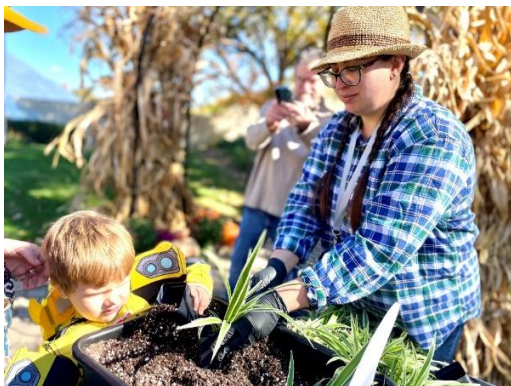
A volunteer assisting those in costume to pot a plant during Garden Trick-or-