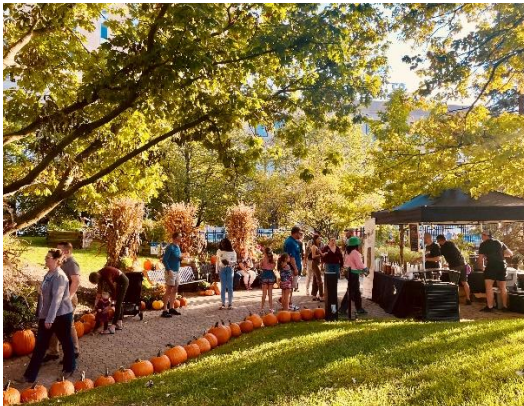
Guests of Botanical Brew enjoy fall scenery while exploring a variety of beverage