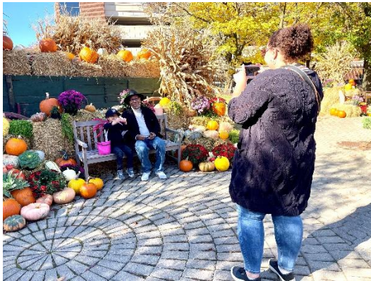
Event attendees taking advantage of a fall photo op during Garden Trick-or-