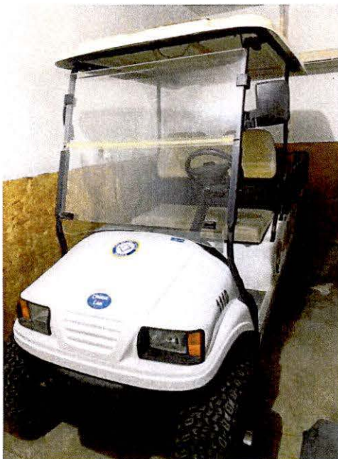
Old Cruise Carts