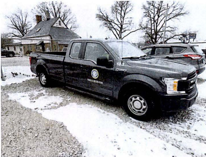
Old Truck 183