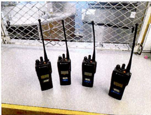
Old Motorola XTS 2500 radios

Replacement Cost: $129,212.97 (for budget year 2025)