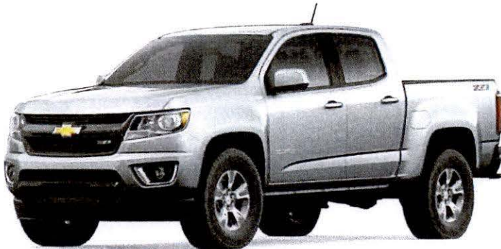
2025 Chevrolet Colorado