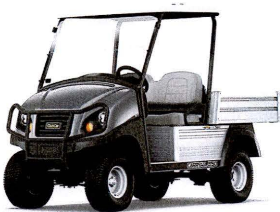
Club Car 550 gas models