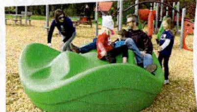
VOLTA® INCLUSIVE SPINNER