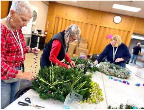
Volunteers helping to decorate and prepare for the holidays