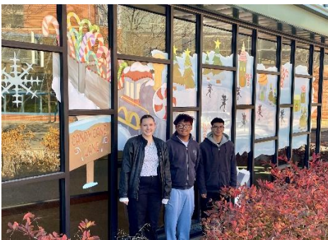
Anthis Career Academy Students posing with their collaborative design for a local contest