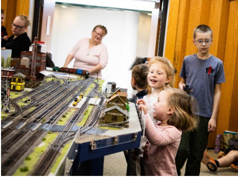
Visitors enjoying train displays during the Great Train Connection