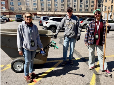
Pictured here are a few Volunteers who answered a callout for spring cleaning the outdoor gardens