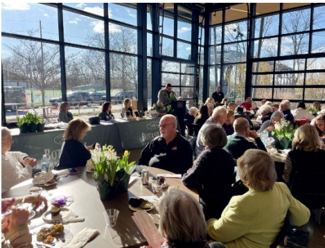
Remarks held at the Annual Volunteer Celebration Dinner