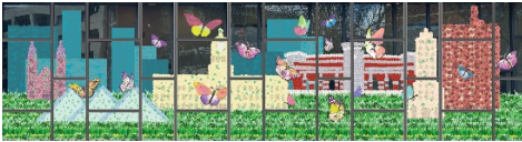
2026 Spring Window Design by Anthis Graphic Design Students