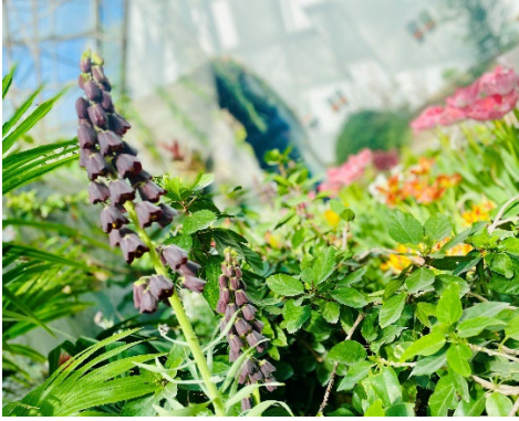
Spring bulbs are blooming the last few weeks of Fern's Fairylight Express