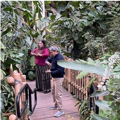
Students practicing T'ai Chi after hours in the Tropical House