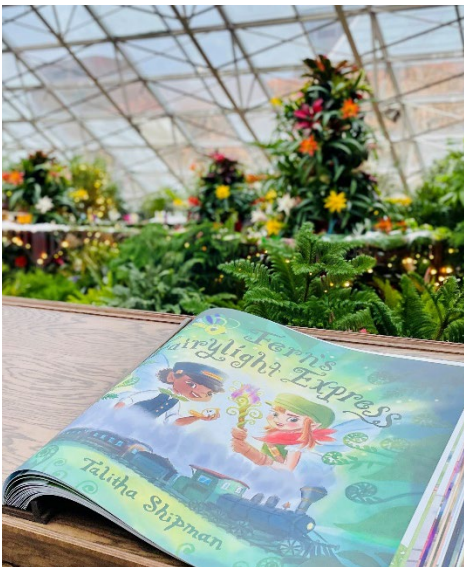
An XXL version of Fern's Fairylight Express in the Showcase House