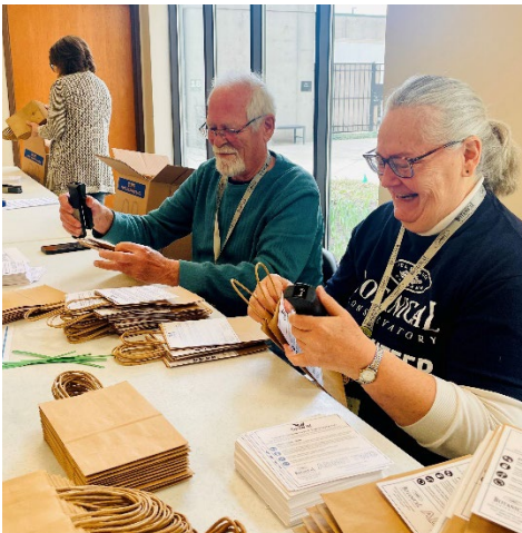
Volunteers prepping bags and seeds for Grow it! School Plant Program